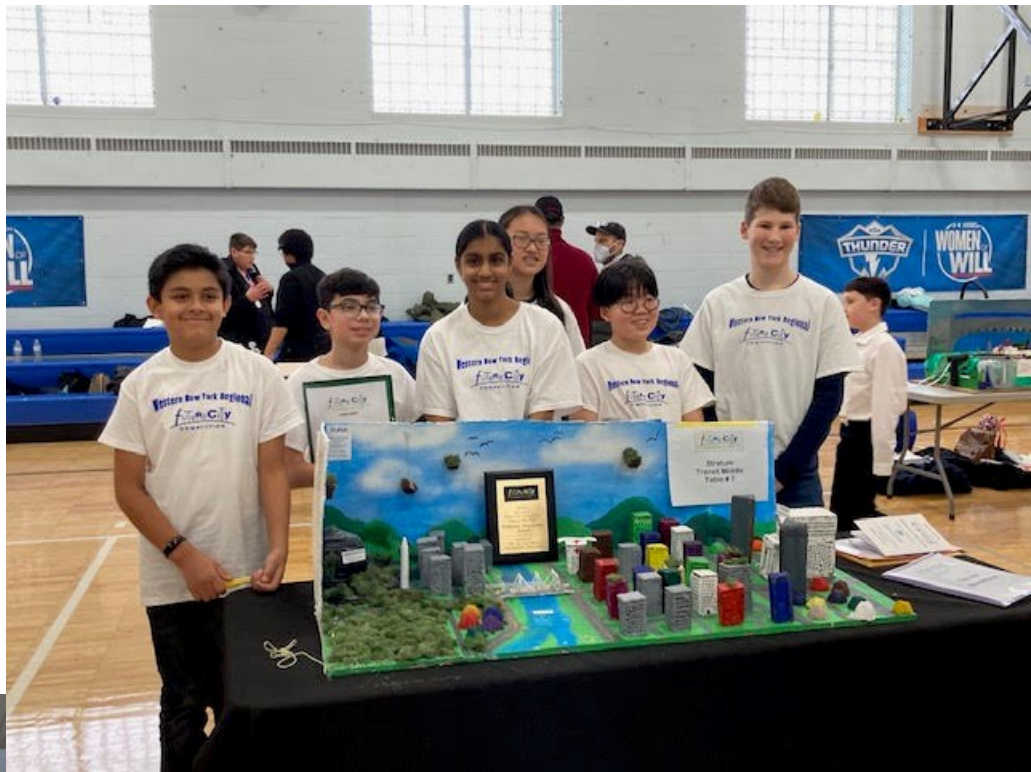
Transit Middle School Team