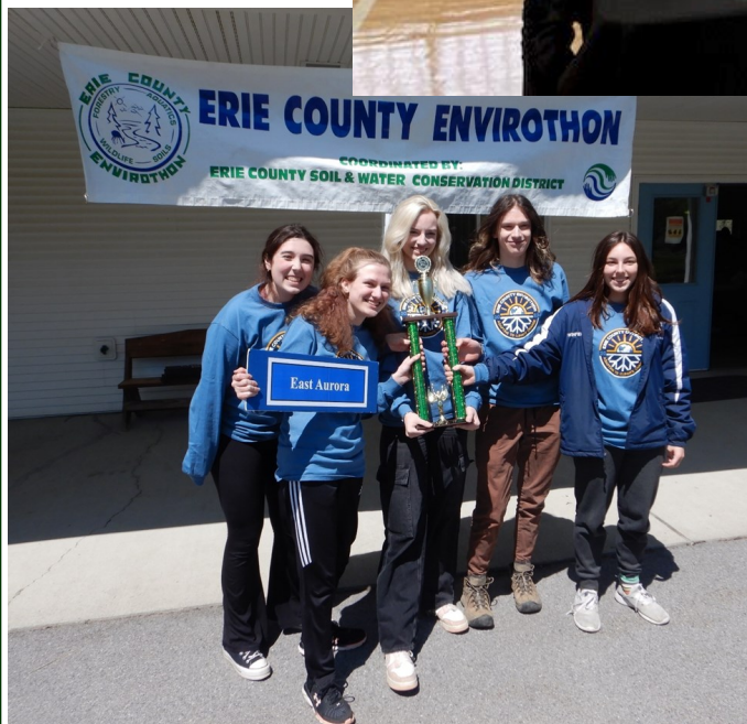
2023 Grand Prize Winners—Erie County Envirothon