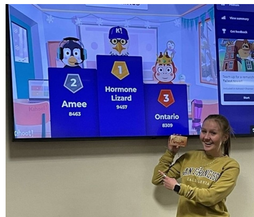
"Tree-Via" Contest Winner

Daemen University – Daemen University's past campus Earth Day/Arbor Day celebrations have been limited to a single event and day each year. Given the importance of our impact on the planet and increasing awareness of the environment, we are planning to host a month-long series of events on the Amherst campus in April 2023. The month's events begin with a campus cleanup on April 1 as part of the National Wildlife Federation (NWF) Clean Earth Challenge. A campus ecochallenge will run from April 1st through 30th and will encourage students to engage with the outdoors, learn about environmental issues and make better lifestyle or behavioral choices to minimize their impact. In honor of Arbor Day, there will be a tree planting during the week of April 29th. Students will be encouraged to participate in the planting and commemoration of the new native tree (donated tree). The Student Activities Team will be leading a rock painting event to encourage nature-based designs on the rocks which could be used as tree borders. A "Tree-via" (trivia contest focused on trees and nature) will be hosted to help everyone learn more about the importance and identification of trees as well as nature appreciation.