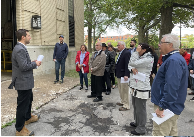
BSA Bird Island Sewage Treatment Plant tour