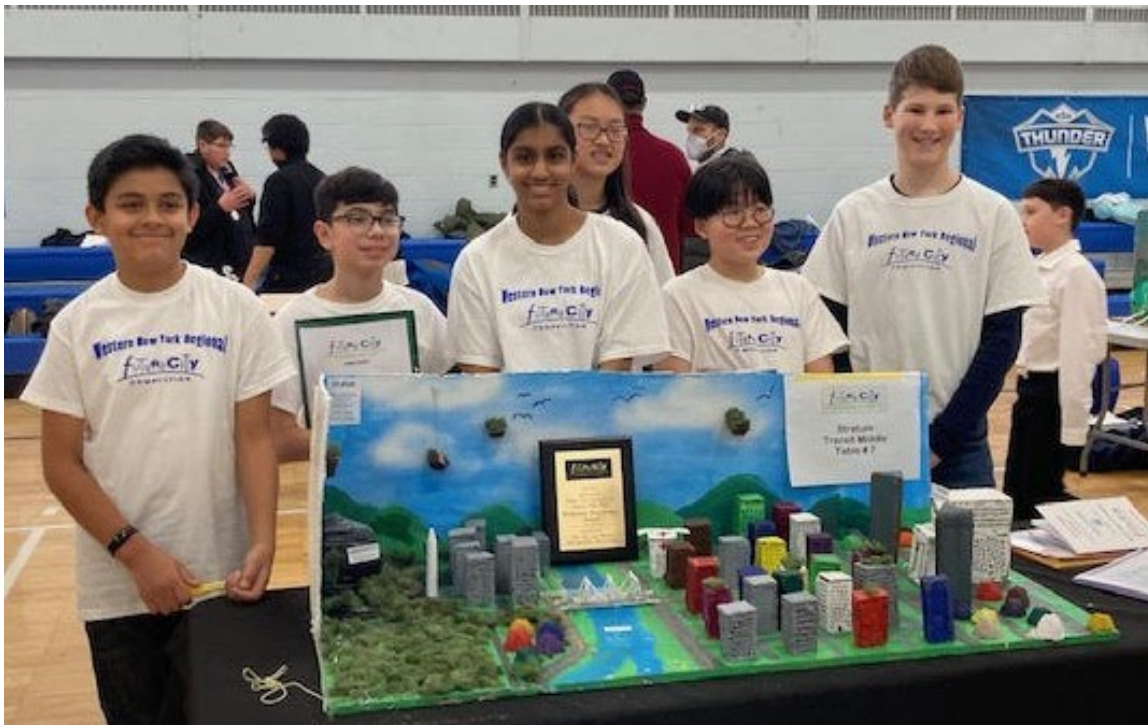
2023 Future Cities AWMA Team Winners